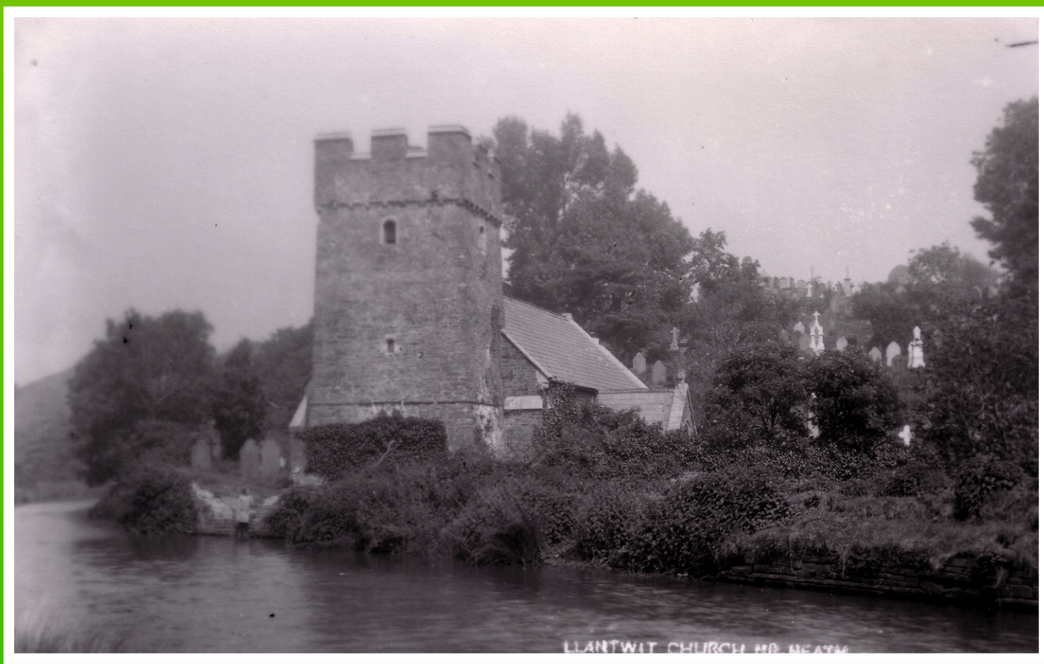
Llantwit Cottage & Llantwit Church.