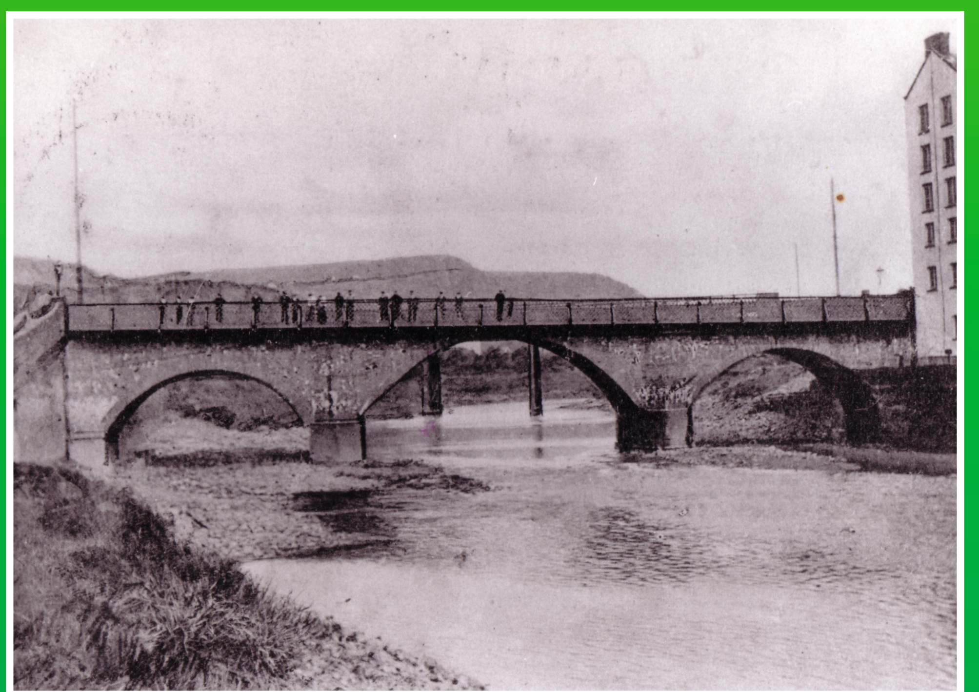
Neath River Bridge